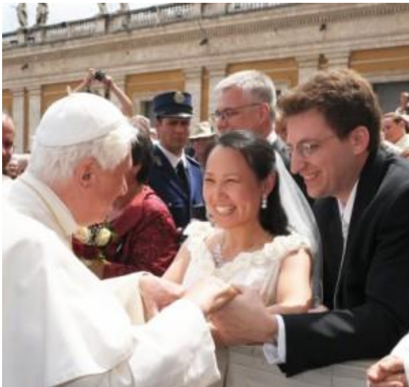
Pope Emeritus Benedict XVI greets wedding couple in St. Peter's Square

His mother said to the servants, "Do whatever He tells you." ... Jesus said to them, "Fill the jars with water." And they filled them up to the brim, and the water had turned into wine.