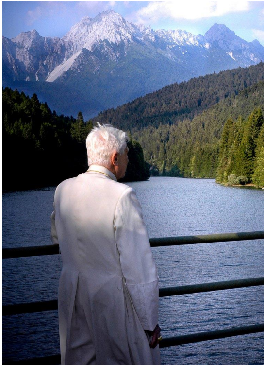
Pope Emeritus Benedict XVI visits Dolomite mountains, Italy, 2007

"As he was praying, the appearance of his clothes become dazzling white. And a voice came from the cloud saying, "This is My Son, My chosen One; listen to him!"