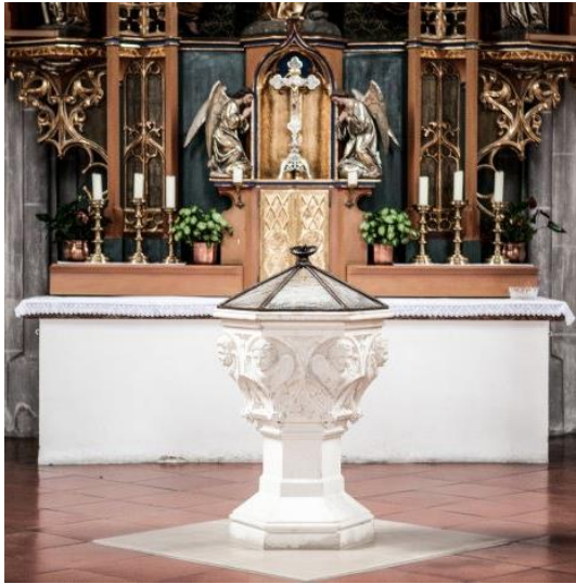
Font in which Pope Emeritus Benedict XVI was baptised, Marktl, Bavaria, Germany

“And when Jesus was baptized the heavens were opened and He saw the Spirit of God descending like a dove, and resting on Him, and a voice from the heaven, said, "this is My beloved Son, With whom I am well pleased; listen to Him."